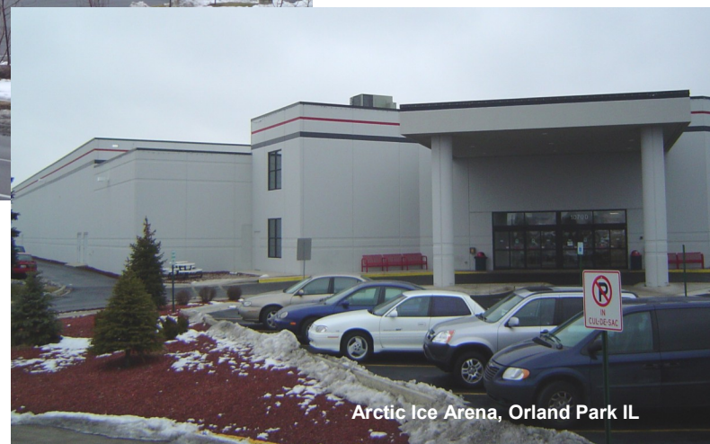
Arctic Ice Arena, Orland Park IL