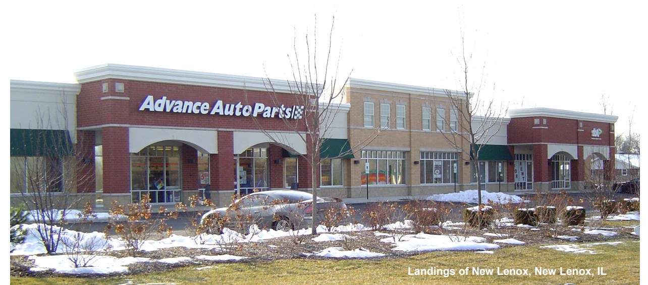
Landings of New Lenox, New Lenox, IL

General Contractor As General Contractor, the professionals at Waner Enterprises will manage the construction of your project. A principal from our company will consult with you and your architect to establish a clear scope of work for your project. Our estimating team will ensure that every detail of your project is defined and value-engineered while selecting the most qualified subcontractors to perform the work. Our project managers, superintendents and job coordinators will ensure quality results while closely monitoring the project budget and schedule.