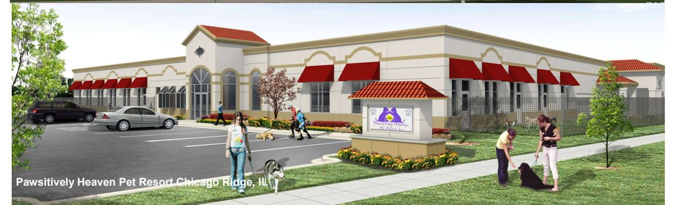
Pawsitively Heaven Pet Resort Chicago Ridge, IL