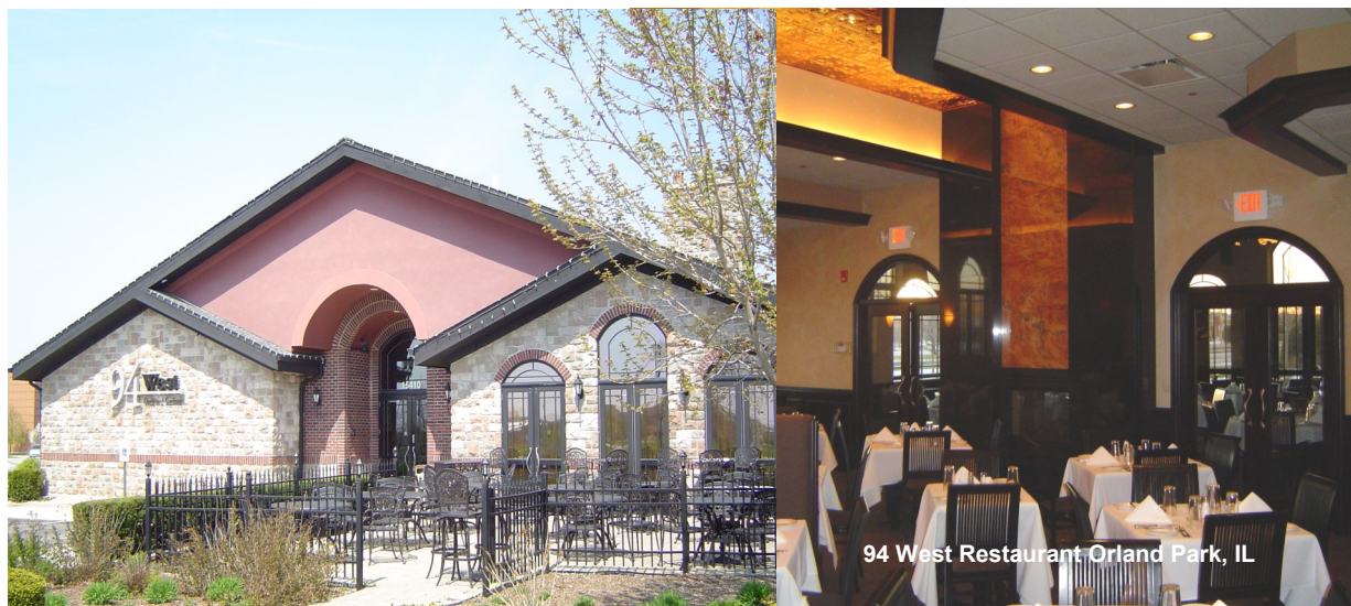
94 West Restaurant Orland Park, IL

Waner Enterprises, Inc. provides a broad range of services in the retail, office, commercial, and industrial venues. Our expertise in these areas is provided on a repeat basis to a wide range of clients.