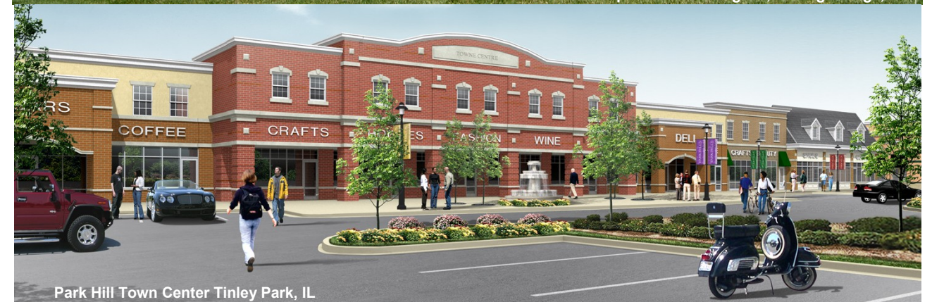
Park Hill Town Center Tinley Park, IL