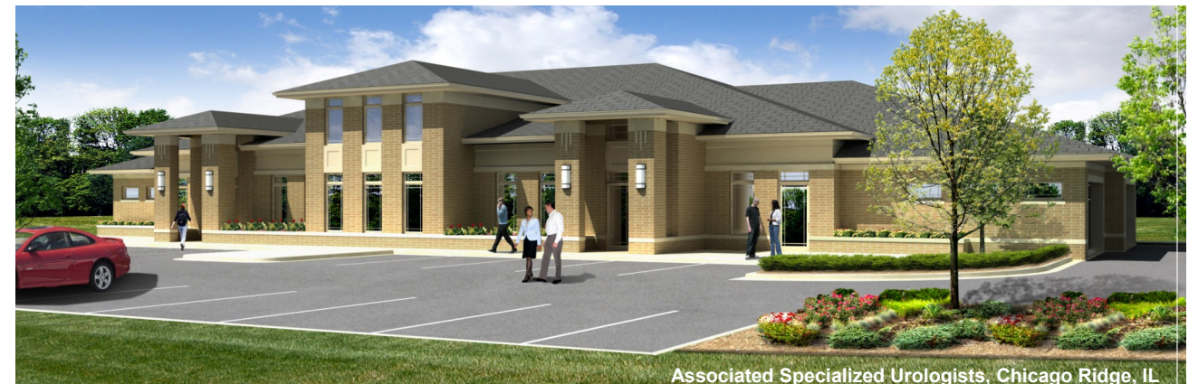
Associated Specialized Urologists, Chicago Ridge, IL