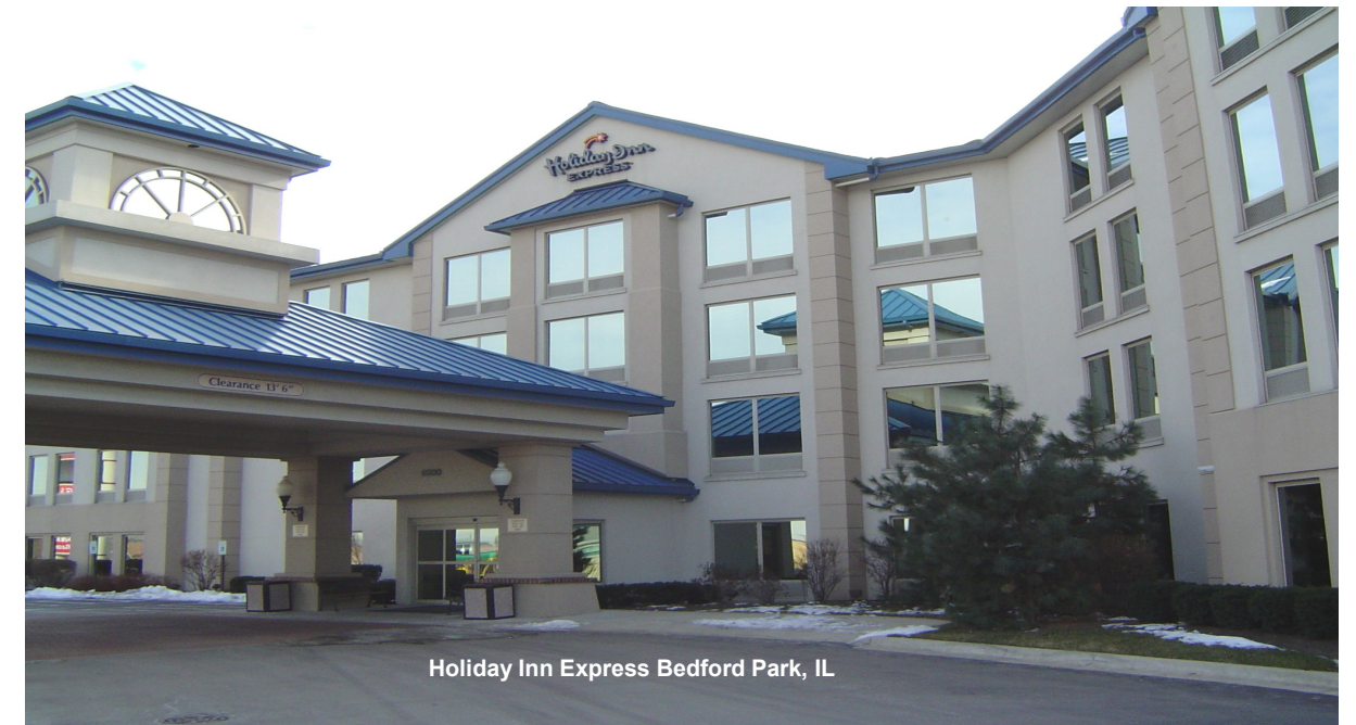
Holiday Inn Express Bedford Park, IL

Design Build This service provides a single source of responsibility for the entire project. Waner Enterprises, Inc. develops designs based on our client's budget. This method significantly reduces time and cost. We then take full responsibility to meet their needs. Waner Enterprises takes prides in being able to control our own time in addition to organizing and expediting subcontractor schedules. Furthermore, we work closely with the Owner to ensure that a project is completed on time and within budget.