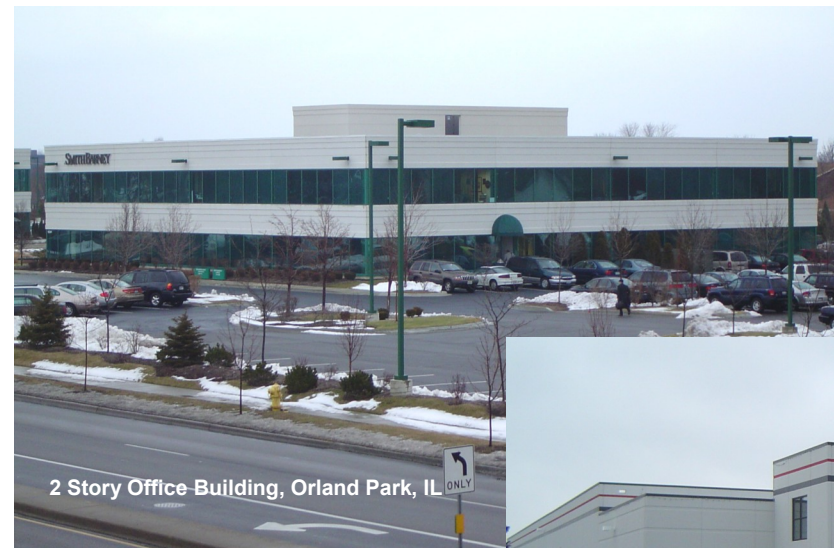
2 Story Office Building, Orland Park, IL

The Construction Management delivery method allows Waner Enterprises to provide greater value engineering input during the design phase resulting in a more realistic budget and schedule during the early stages.