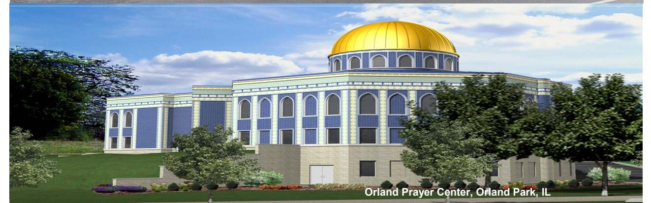
Orland Prayer Center, Orland Park, IL