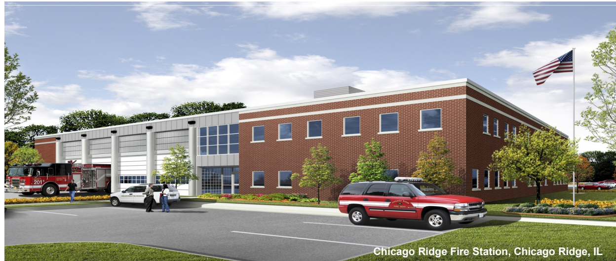
Chicago Ridge Fire Station, Chicago Ridge, IL

Construction Management As Construction Manager, Waner Enterprises will operate as the decision maker on your behalf. Whether it be value-engineering or controlling the bidding process for your project; Waner Enterprises will act in your best interest to ensure that your project is on the right track. With over 45 years of experience within the construction industry, We provide unparalleled expertise when managing your project in this capacity.